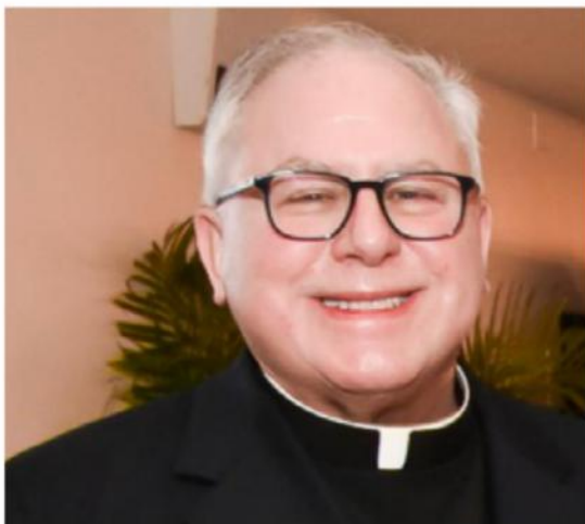
Ps. That's me with hair...