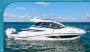
2025 32' NHD 325 OPEN DECK

FAITH IS A BELIEF THAT GOD IS ALWAYS WITH YOU.