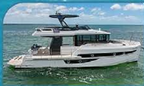
2024 52' OKEAN