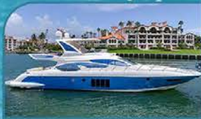
2012 64' AZIMUT FLYBRIDGE