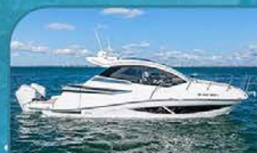
2025 32' NHD 325 OPEN DECK

FAITH IS A BELIEF THAT GOD IS ALWAYS WITH YOU.