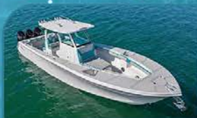
2025 35' STREAMLINE