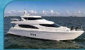
2007 80' HATTERAS 80 MOTOR YACHT