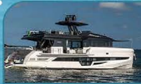
2021 80' OKEAN