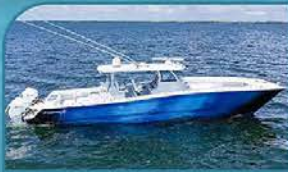
2023 47' FREEMAN