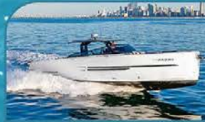
2025 57' OKEAN