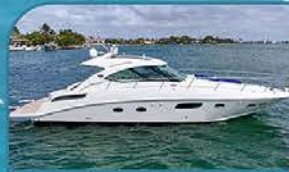
2011 47' SEA RAY