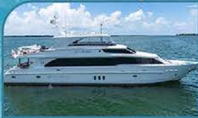
2016 101' HARGRAVE