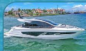
2022 66' SUNSEEKER PREDATOR