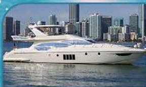
2011 70' AZIMUT