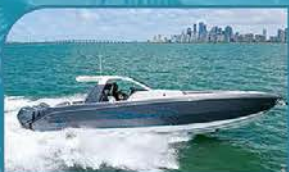
2022 42' CIGARETTE AURORIS