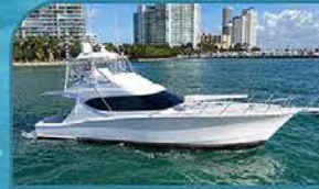
2013 54' HATTERAS GT