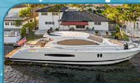
2009 76' LAZZARA