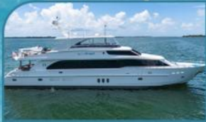
2016 101' HARGRAVE