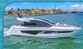
2022 65' SUNSEEKER PREDATOR