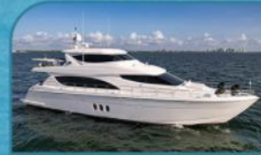
2007 80' HATTERAS 80 MOTOR YACHT