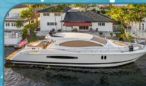
2009 76' LAZZARA