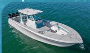
2025 35' STREAMLINE