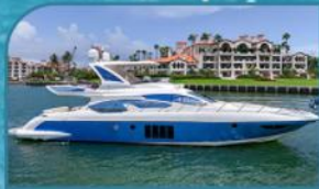
2012 64' AZIMUT FLYBRIDGE