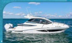
2025 32' NHD 325 OPEN DECK

FAITH IS A BELIEF THAT GOD IS ALWAYS WITH YOU.