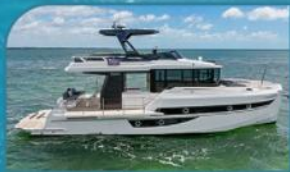
2024 52' OKEAN