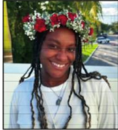
“Encountering the light of Christ within”