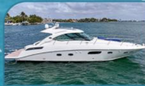
2011 47' SEA RAY