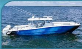
2023 47' FREEMAN