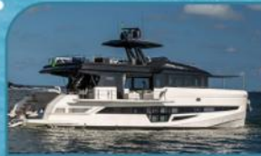
2021 80' OKEAN