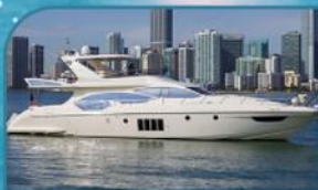
2011 70' AZIMUT