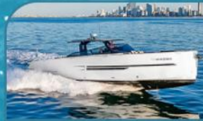
2025 57' OKEAN