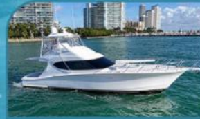
2013 54' HATTERAS GT