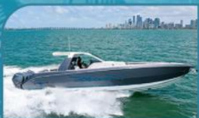
2022 42' CIGARETTE AURORIS